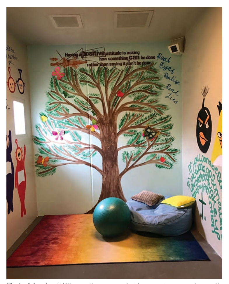
Photo 4 A colourful 'time out' space created by young women at a youth justice residence

Sometimes I think that no one cares about us. We are invisible."