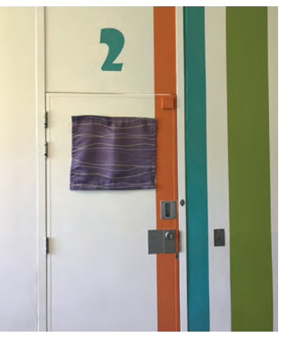
Photo 6 Outside a young person's bedroom at a care and protection residence

However, despite evidence of residences' forward movement in several areas, we remain concerned about many aspects of the residential environment. CYF residences contain young people with the most challenging behaviours. In both youth justice and care and protection residences, a large proportion of the children and young people have behavioural, emotional and mental health problems and a range of neurodevelopmental disabilities and needs. In the youth justice residences, the majority of young people have conduct disorders or alcohol and other drug problems. One recent New Zealand study found that 66% of young people in youth justice residences met the criteria for alcohol and drug problems<sup>4</sup>. In this very challenging environment, there is room for improvement across all six